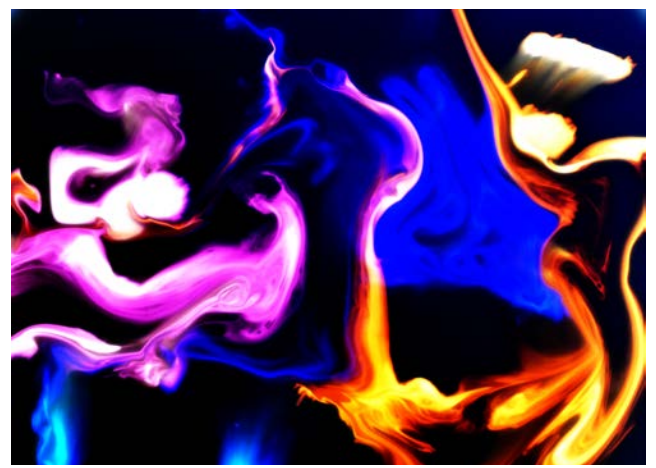
Figure 3 Final Image

The image reveals the randomness and beauty that different surface tensions can impose on multiple fluids. The physics can be seen with this photo but a video of